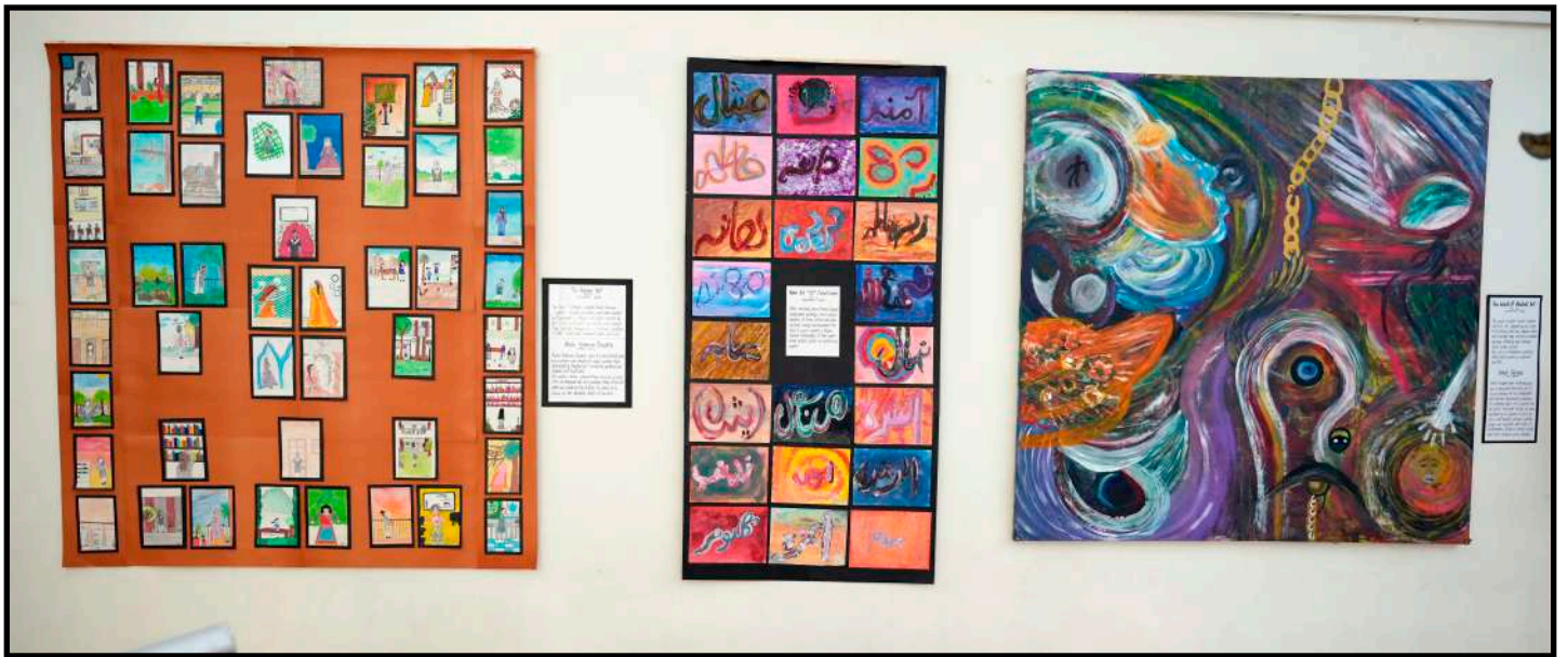
Artwork that is vibrant, expressive, and imaginative.