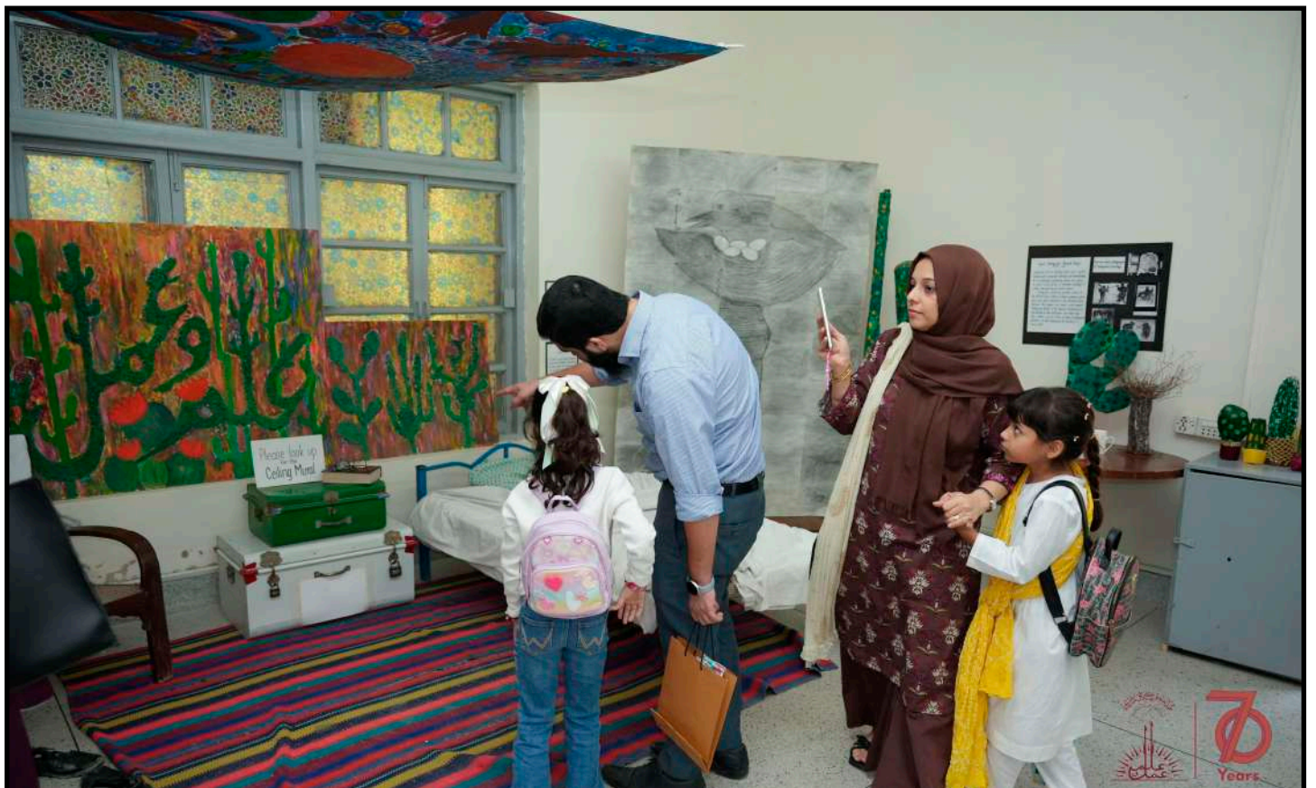
A parent pointing out Sadequain's work to his daughter.