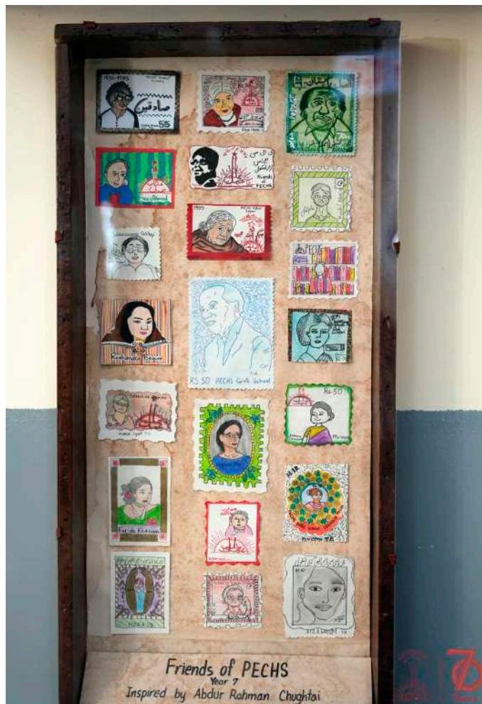
People who accompanied us in our journey.