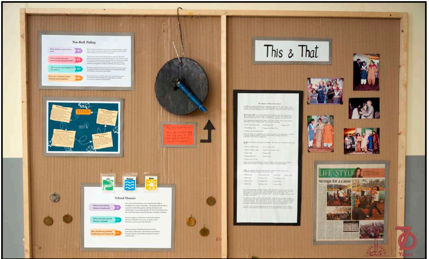
An era of major transformation in our pedagogical perspective.