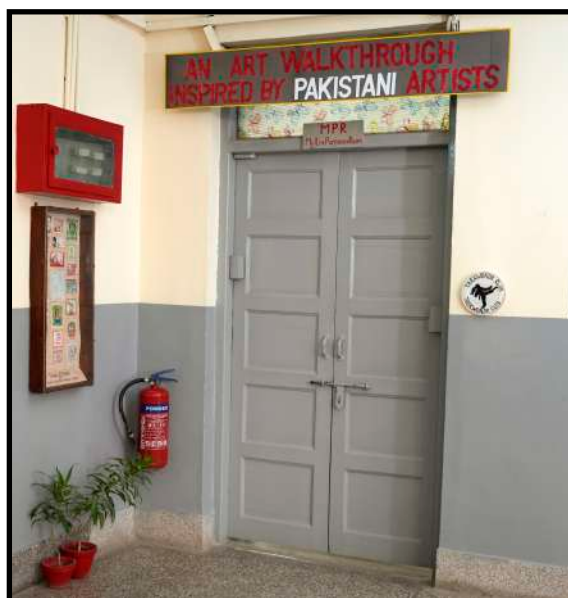
A doorway that opens to creativity.

The Historical Walk-Through of Pakistani Artists, connected with the School's Historical Walk-Through, is an exhibition of artworks displayed in MPR 1. These artworks inspired by prolific Pakistani artists, were created by our students of Years 1-7 during their art classes.