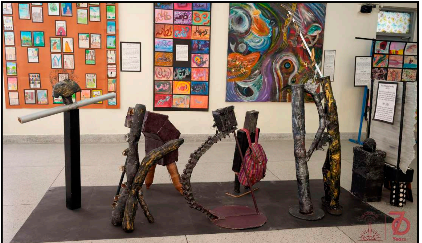
These Gulgee inspired 3-D sculptures depict the damage heavy bags do to our spines.