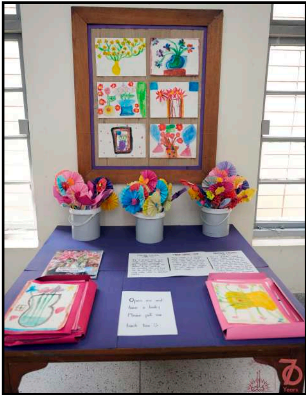
Mona Naqsh inspired flowers