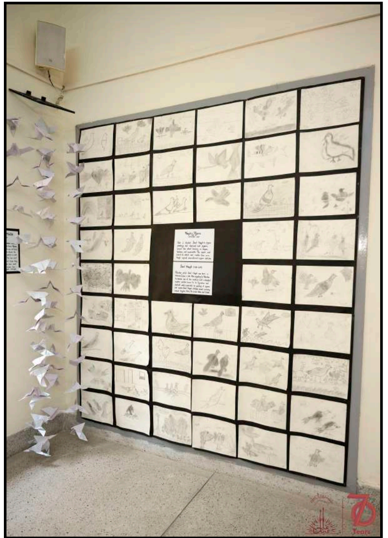
Origami & pencil sketched Birds inspired by Jamil Naqsh