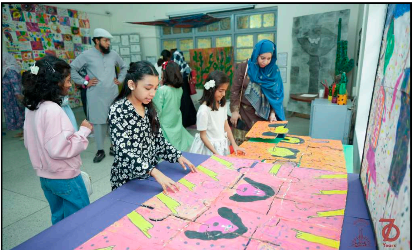
Students explore puzzles based on our SEL programme