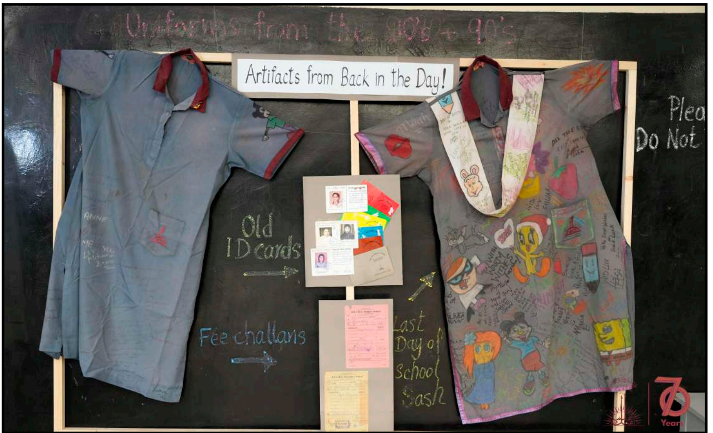
Uniforms and ID Cards from the Past!